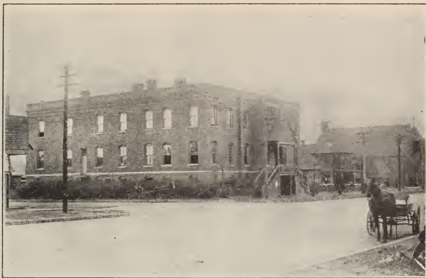
SAINT MARK'S INDUSTRIAL SCHOOL, BIRMINGHAM, ALABAMA